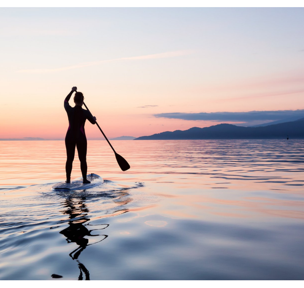
These activities sound cool but how do I organise all this?

All travel experiences will be organised by Flight Centre Travel Academy and our employer and industry partners.