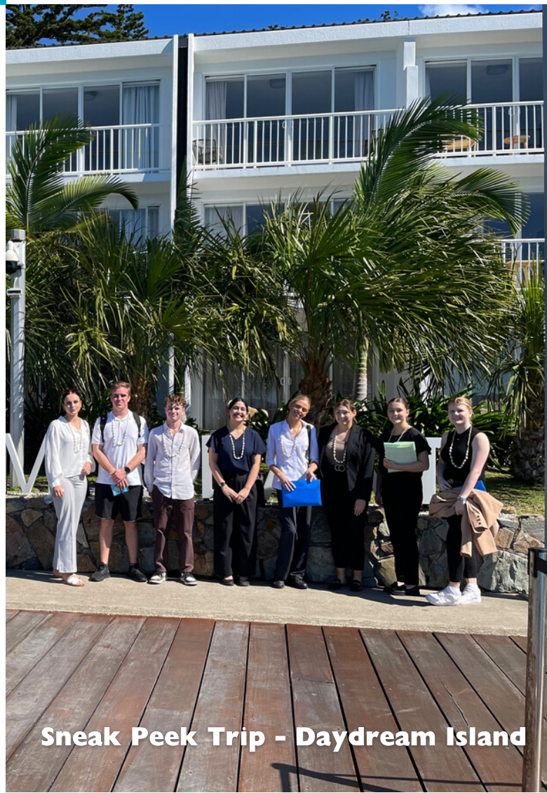
Sneak Peek Trip - Daydream Island