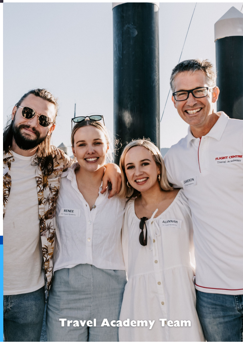
Travel Academy Team