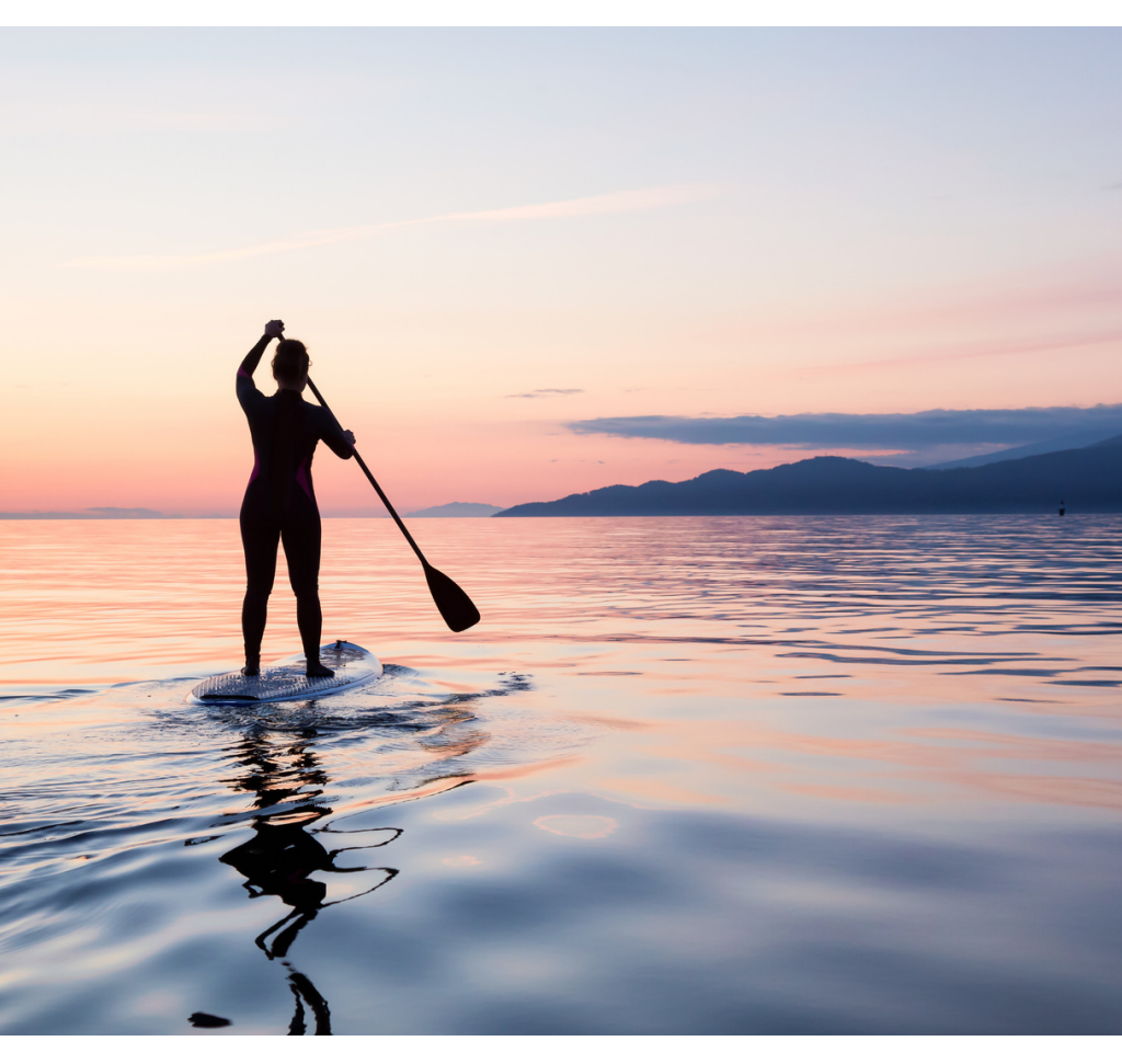
These activities sound cool but how do I organise all this?

All travel experiences will be organised by Flight Centre Travel Academy and our employer and industry partners.